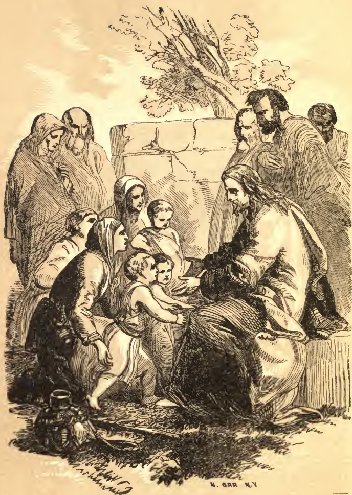
JESUS BLESSING LITTLE CHILDREN